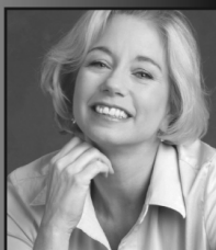
Laura Lippman The Most Dangerous Thing