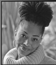
Terry McMillan Getting to Happy