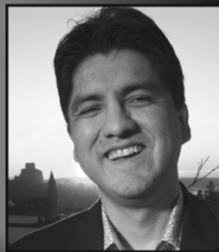
Sherman Alexie The Absolutely True Diary of a Part-Time Indian 2011 One Maryland One Book