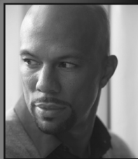
Common One Day It'll All Make Sense